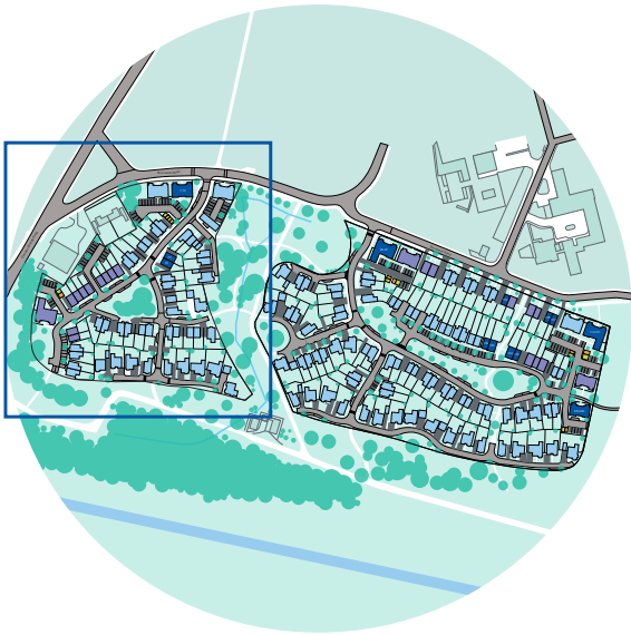
Full site plan

Our homes are built to the very highest standard and are inspired by their natural surroundings, with most properties benefitting from private gardens or outside space plus allocated parking and cycle storage to apartments.