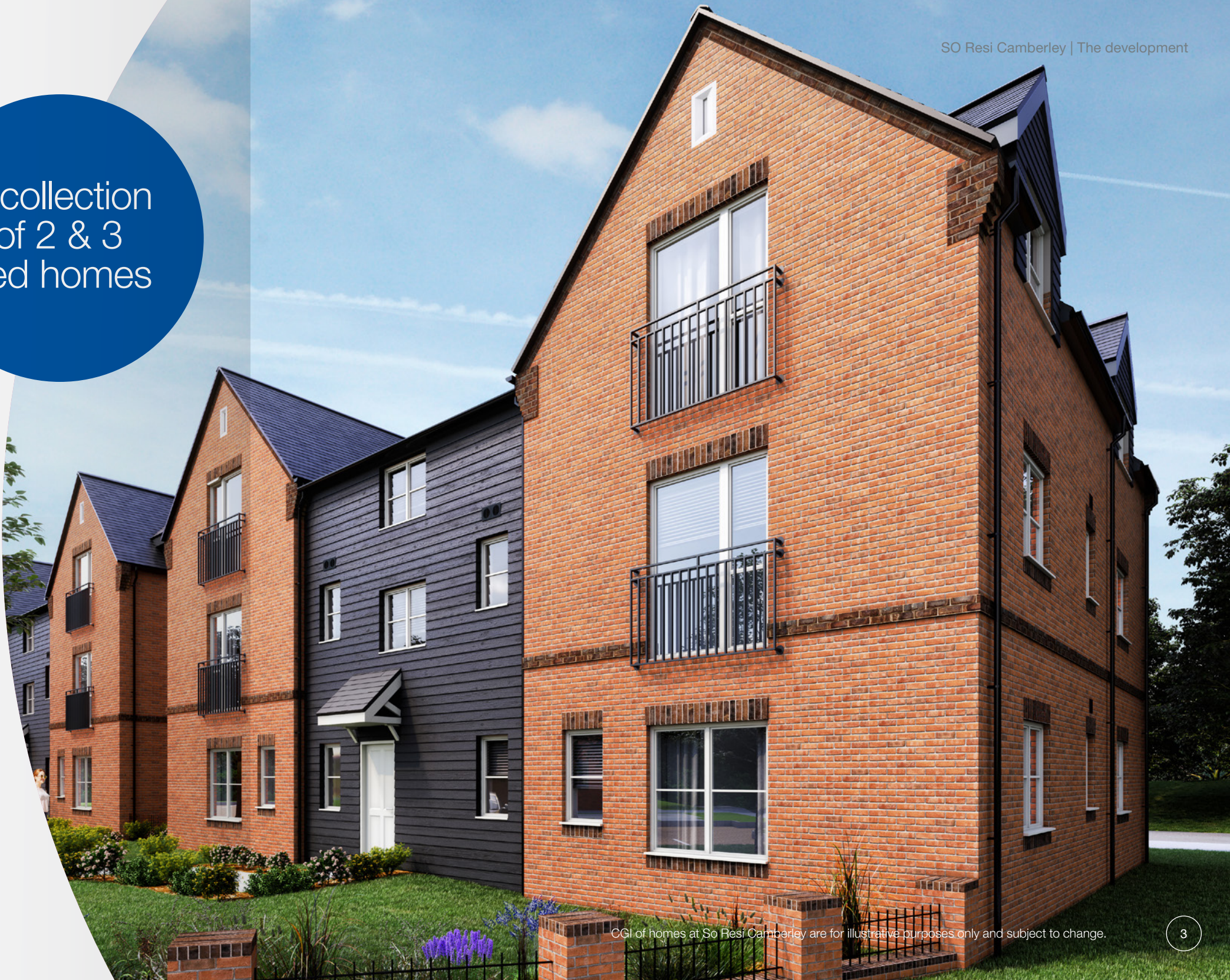
CGI of homes at So Resi Camberley are for illustrative purposes only and subject to change.