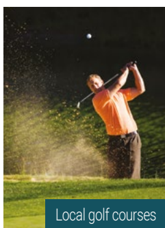
Local golf courses